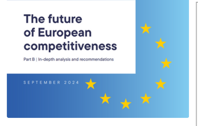
<u>Report on The Future of European</u> <u>Competitiveness</u>

The European Commission tasked former ECB President Mario Draghi with creating a report on the future of European competitiveness, presented on September 9.